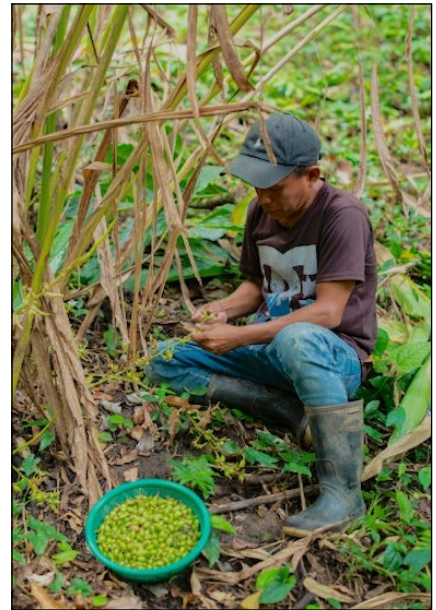
A worker picks cardamom in Guatemala, the world’s leading producer and exporter of that spice. Cardamom is also the world’s third most expensive spice, after saffron and vanilla.

The message is clear – Heifer’s support of sustainable farming around the world brings better agricultural practices, protection of the environment, and better