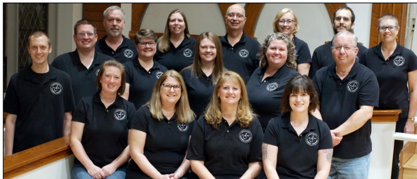
The Hershey Handbell Ensemble will perform at 3 pm April 30.

For more information, visit www.hersheyhandbellensemble.org .