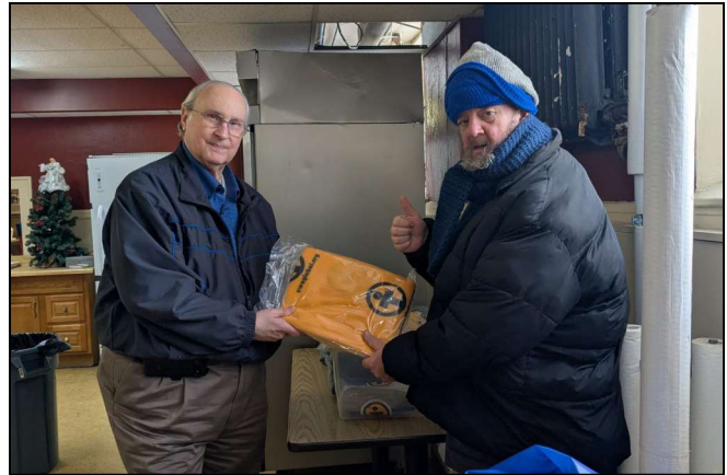
A guest of the community meal at the Nehemiah Mission of Cleveland, Ohio, receives a fleece blanket. The mission provides meals, temporary housing, and support for displaced families.

CWS Blankets and Hygiene Kits are distributed in the U.S. and worldwide to people affected by displacement or disaster. Your donation can make a real difference to a person who faces difficult changes.